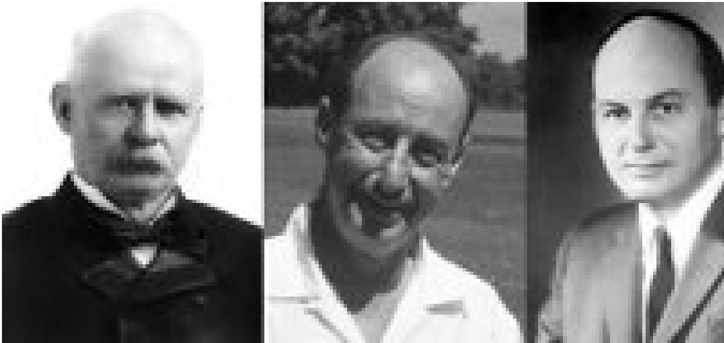
Vice President Senator Adlai E. Stevenson I E. Stevenson III