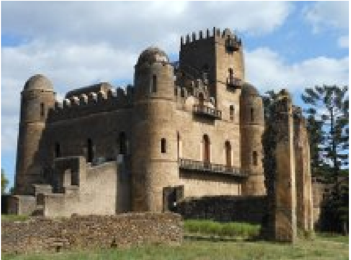
Castle in Gondar, Ethiopia

We all start our exploration of the globe somewhere, and for me it began in the Caribbean. Most think of palm trees and snorkeling, but to me Santo Domingo was my entree into the world - a kind of epiphany. It would take me many years to understand that travel - generally associated with vacation and adventure - could also become a career and my livelihood.